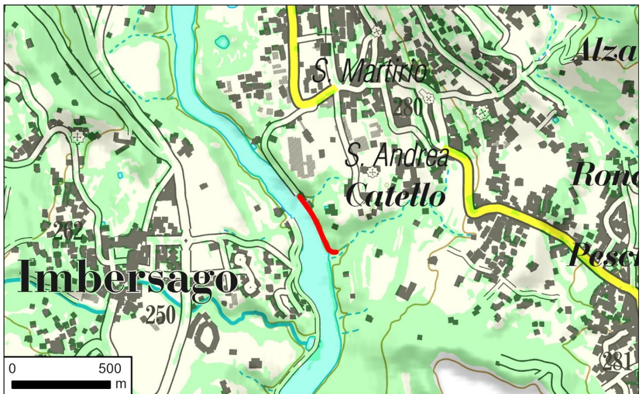
Altimetria di Imbersago