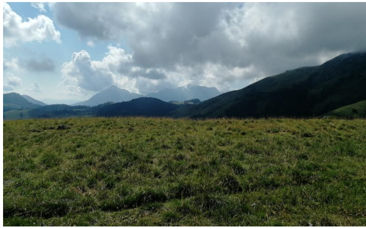
From the Piani D'Alben, the view sweeps over the Piani di Artavaggio with the backdrop of the Grigne.