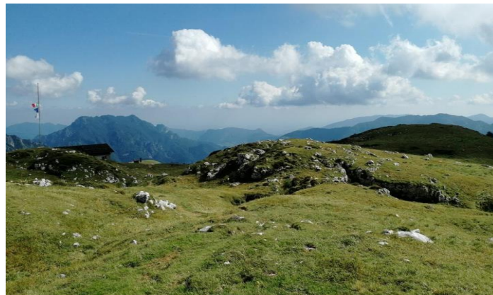
After enjoying the view, all we have to do is turn back and follow the path we took uphill.