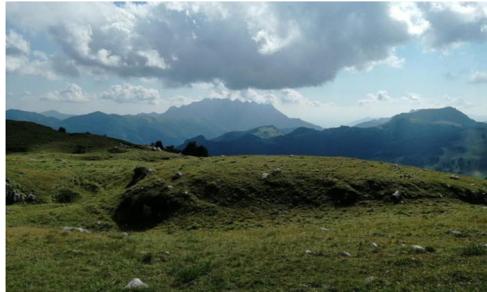
The Resegone can be seen in the background.