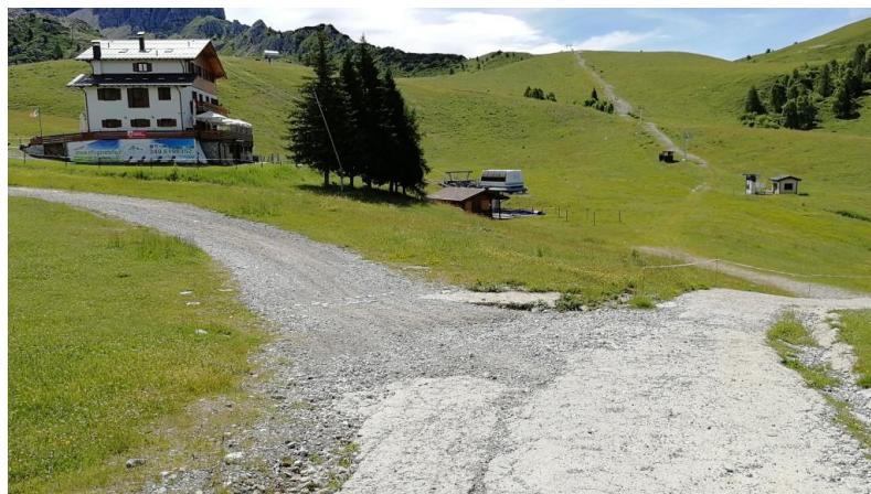
At the crossroads we keep to the left and the road begins to climb again, but by now it is only a short distance, our destination is near.