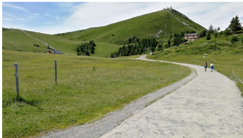
We continue slightly downhill.