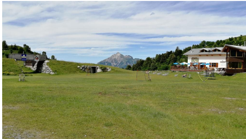
Continuing on, we pass near the "Centro Fondo".