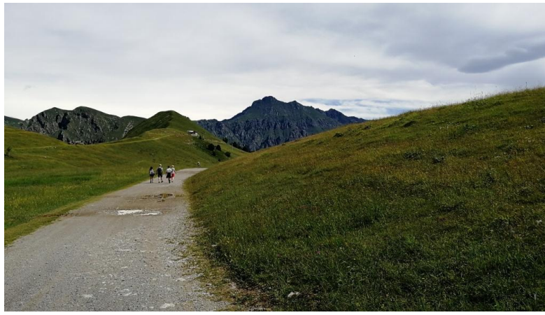
Towards the Pizzo dei Tre Signori.