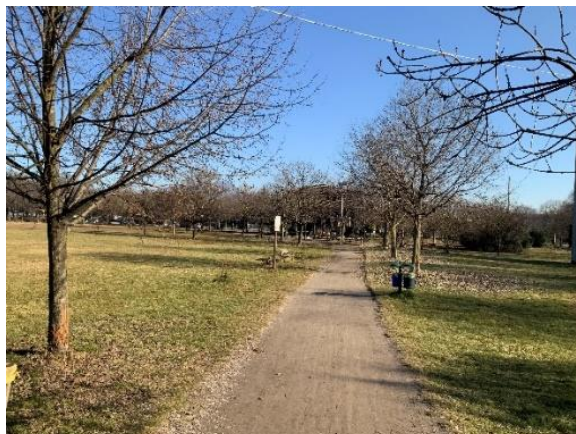
We have now reached the end of our walk and there at the end we see benches and tables for a picnic.