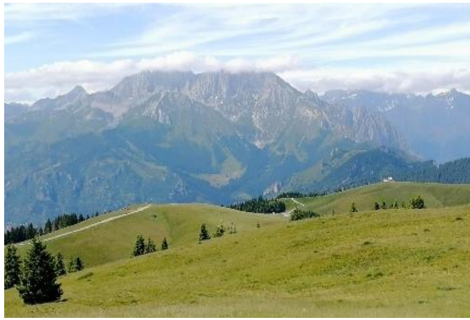
View towards the hooded Presolana.