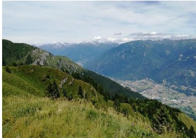
View towards the lower valley.