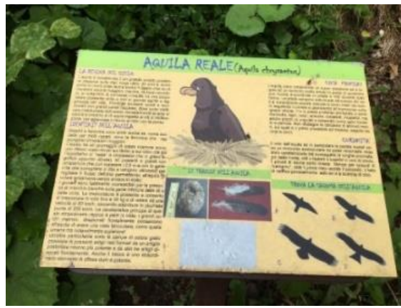
A sign now appears informing us that we are on a forest road with signs illustrating the local fauna.