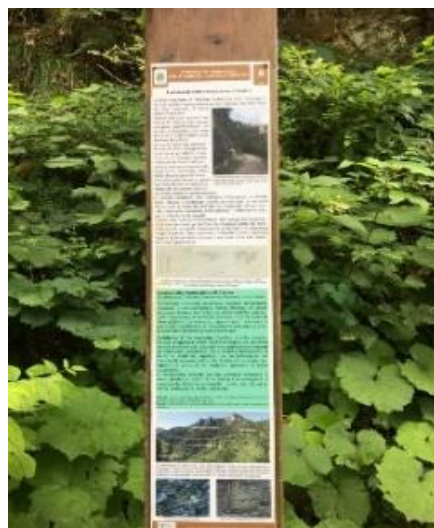
There is a totem informing us of the geological itinerary along the route.