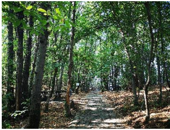
We are in a small forest and the coolness is pleasant.