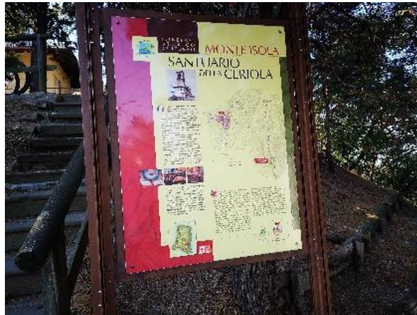
We pass an information board on the shrine.