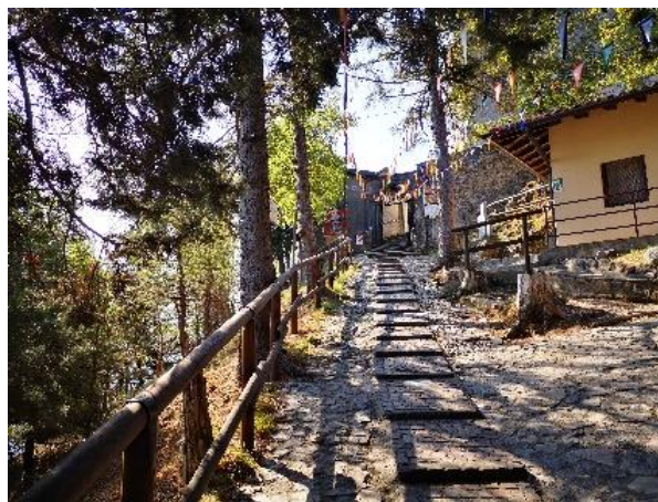
We ascend the final ramp to the Sanctuary.