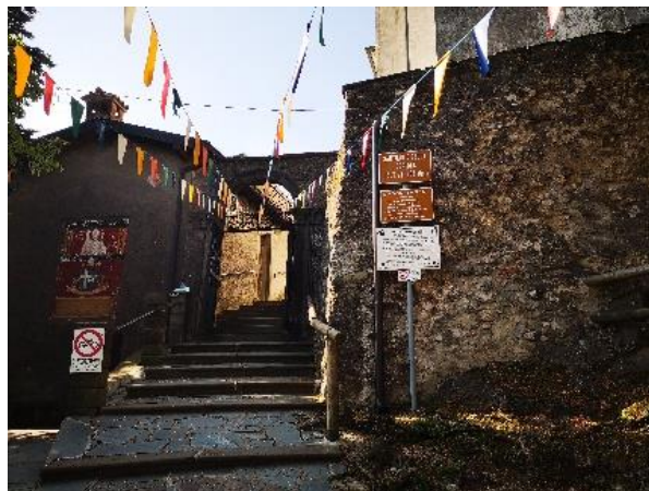
There is a small bar on the right.