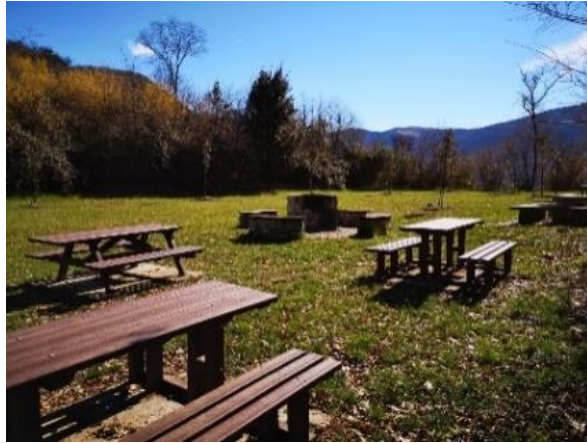
Continuing along our route we come across a rest area equipped with tables and benches.