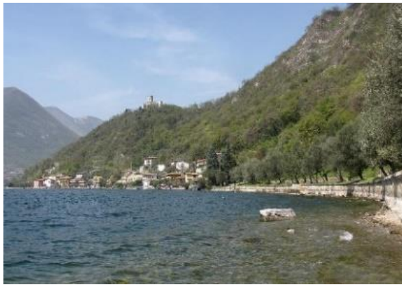
Looking towards Sensole, we admire the long lake.