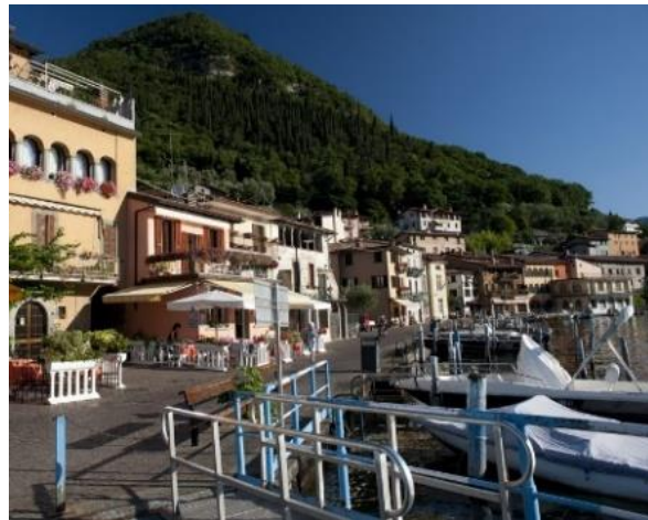
We finally reach Peschiera Maraglio and its landing stage.