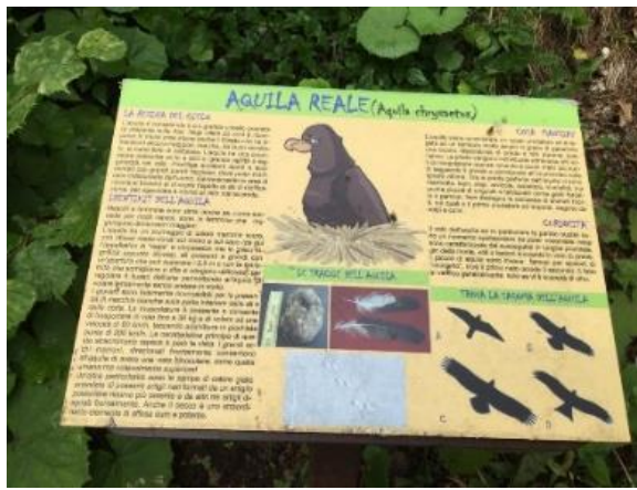
Along the trail, there are didactic signs about the animals present in the forest.