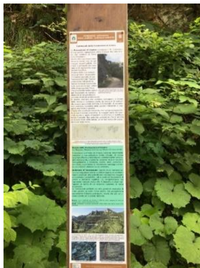
There is a totem informing about the geological itinerary along the route.