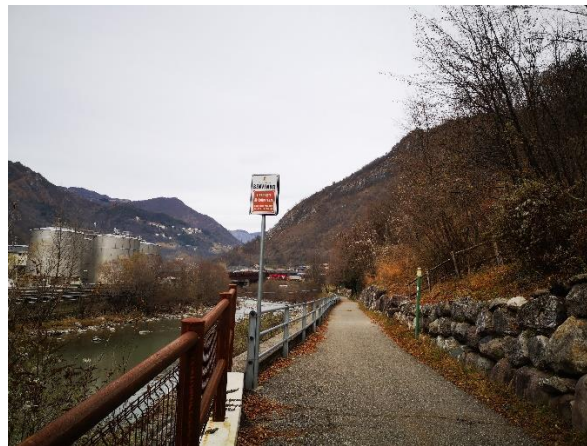
A signpost on the left welcomes us to the path.