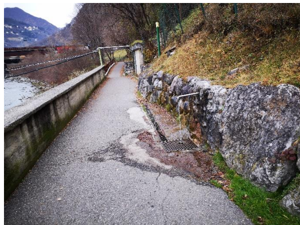
We reach a fountain with running water, very clear and fresh, for a good drink.