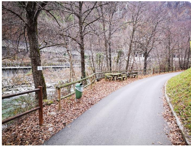
Along the way we encounter, towards the river, a lay-by with tables and benches.