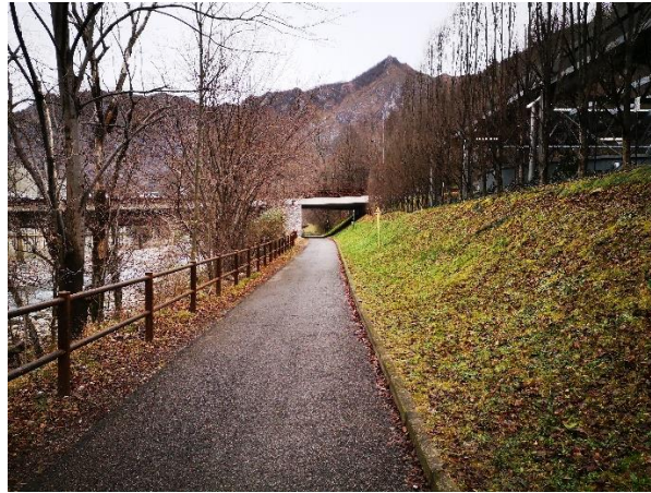
Continuing along we meet a bridge that joins the two San Pellegrino plants.