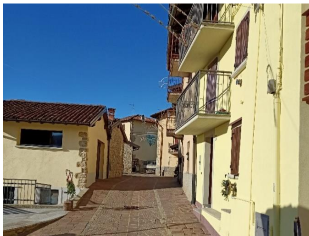
The village is very well maintained, with some wide, paved streets.