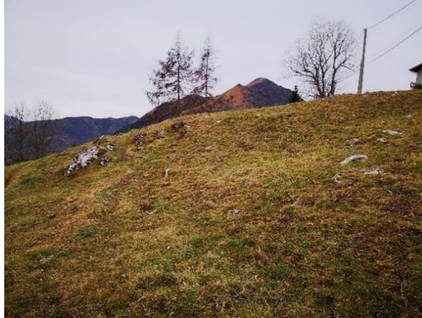
Reaching the meadow at the end of the climb, we turn right and meet the first houses of the hamlet.