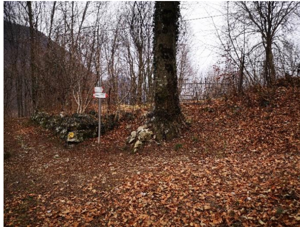
Reaching the next fork in the road, we turn right and following a fence, continue towards Corone.