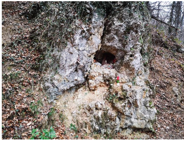
A small crib, with its Madonnina, has been carved into a rock along the route.