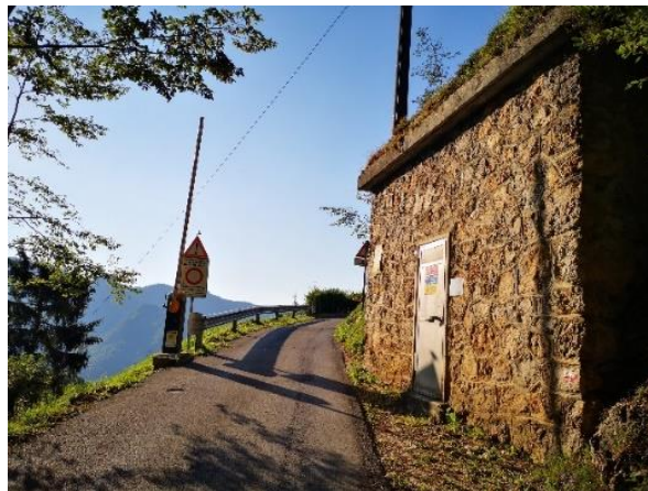
We reach and pass a raised barrier.