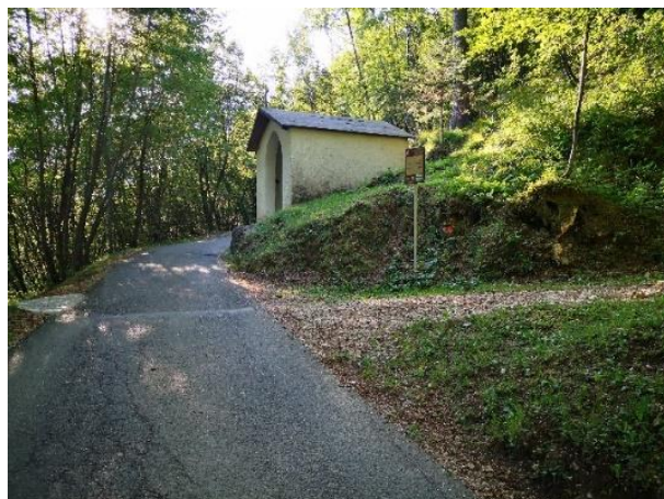
On the right we reach and pass a small chapel.