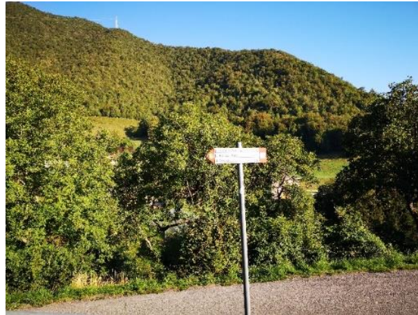
After parking, we follow the signs of the marker pole, CAI path 506 C.