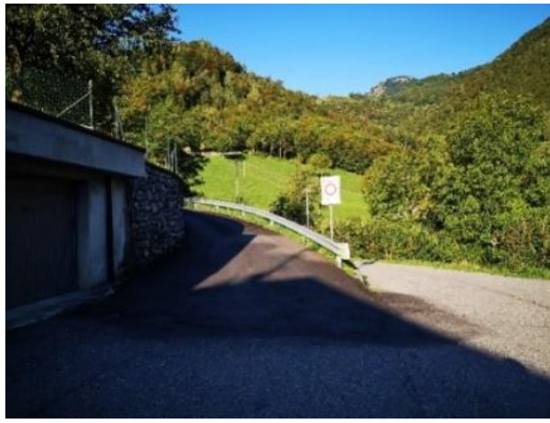
We park near a drinking fountain.