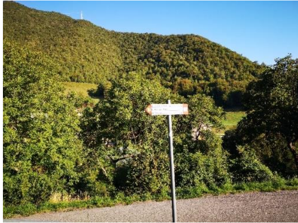
After parking, we follow the signposts, following the CAI 506 C path.