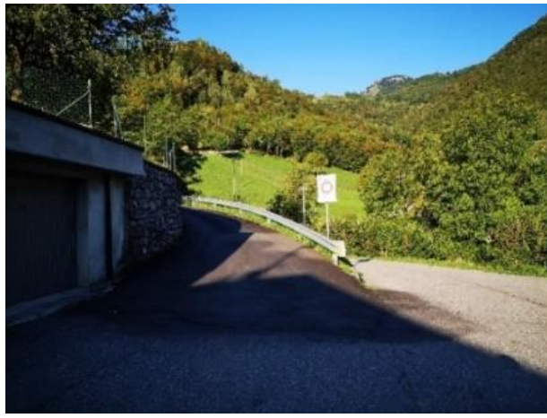
We park near a drinking fountain.