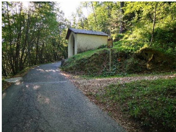
On the right we reach the chapel of the Madonna Addolorata.