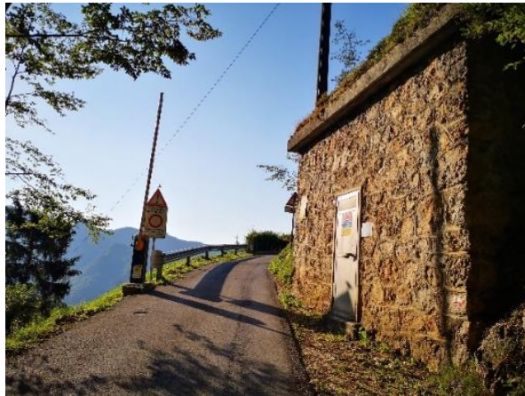
We reach and pass a raised barrier.