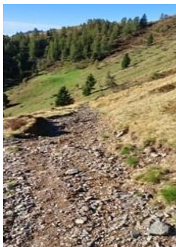
Continuing on a slight descent, we advance on cobbled terrain.