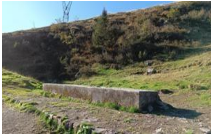
We pass a cemented basin.