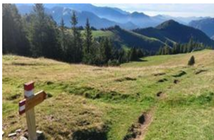
On our left we pass the signpost for the Cantedoldo hut.