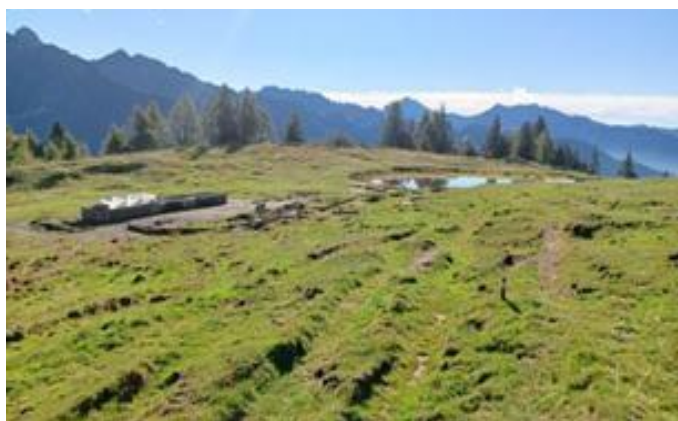
Still on a slight descent, we pass another stone basin and a pond on the right.