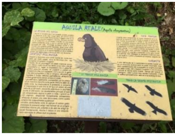
A sign now appears informing us that we are on a forest road with signs illustrating the local fauna.