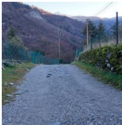
At the top, the slope flattens out and we begin to descend into a small valley.