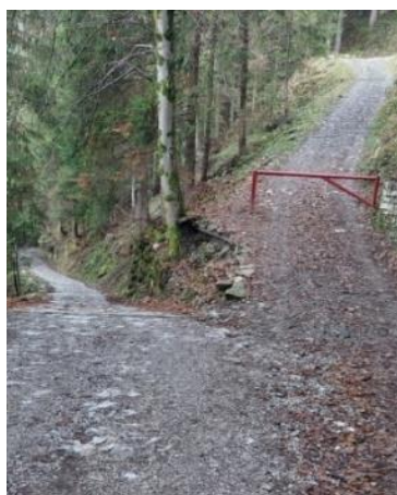
At the fork we continue downhill.