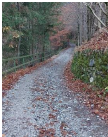
We continue our descent and the air becomes colder and colder.