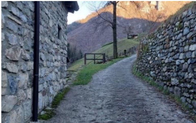
Once past these houses, the path becomes almost flat.