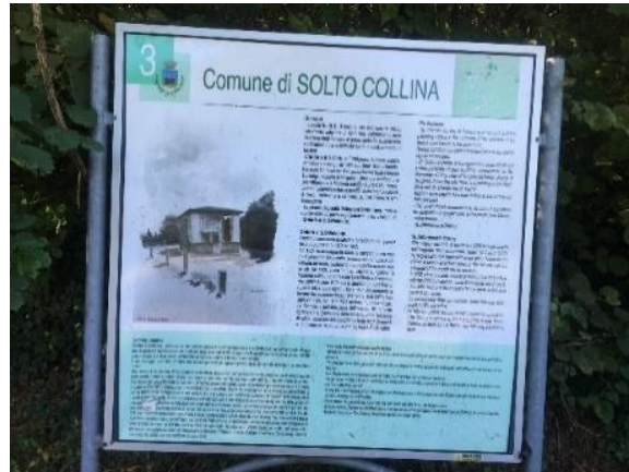
Near the chapel, the first information board is on the right, we follow CAI path 565 C.