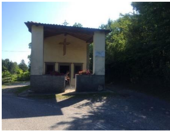
Climbing along the tarmac road, you reach the Chapel of San Rocco.