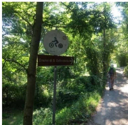
The signpost points us in the direction of the Hermitage of San Defendente.