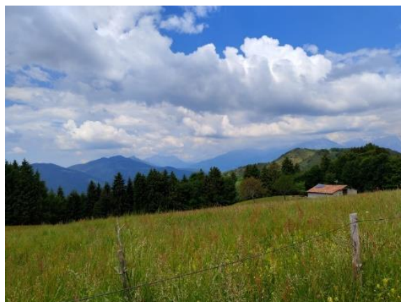
The landscape we encounter changes from the view to the left of the valleys in the distance.