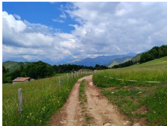
We resume our walk following the dirt track that passes between the huts and the agriturismo.