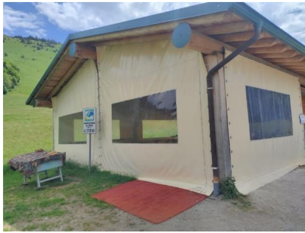
On the left is a structure of an agriturismo.