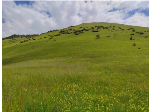
Past the structure we have a view of the summit of Mount Colombina.