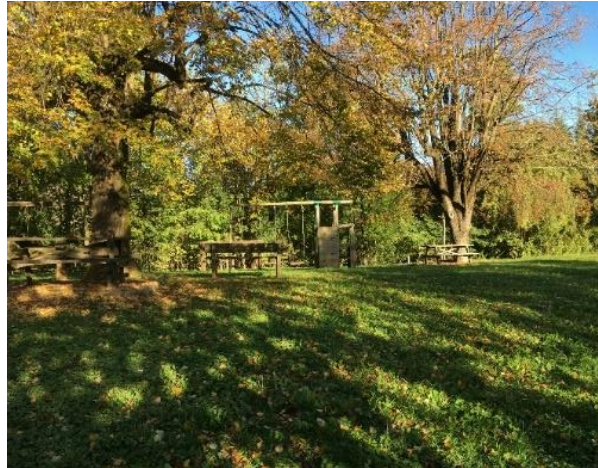
On one side of the lawn there are games for children.