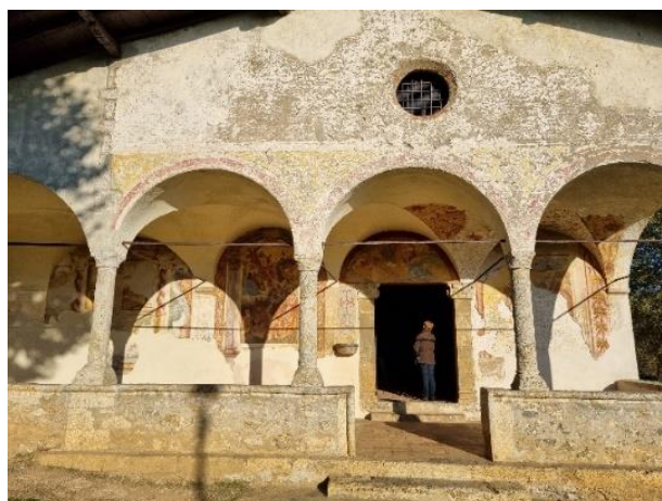
Under the arches, one can glimpse frescoes.