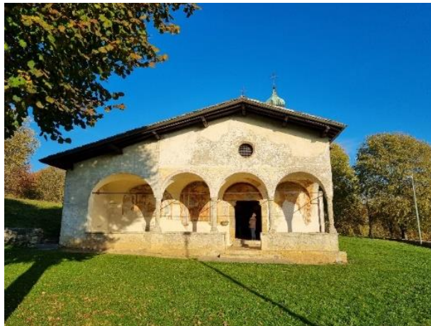
We reach the main entrance of the sanctuary.