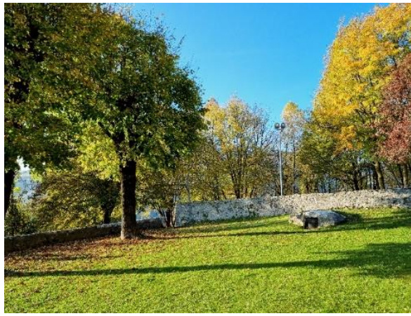
The church is surrounded by a well-kept lawn.