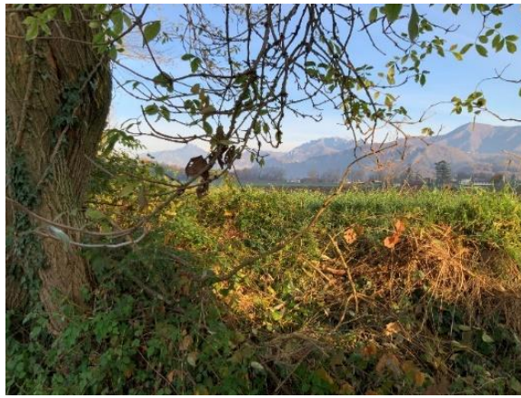
On our right we admire the mountains above Calolziocorte in the distance.