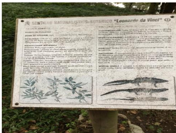
We stop to read the information on the second panel.