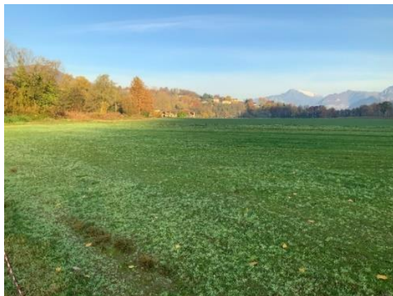
In the distance, at the end of the meadow we see a beautiful farmstead.