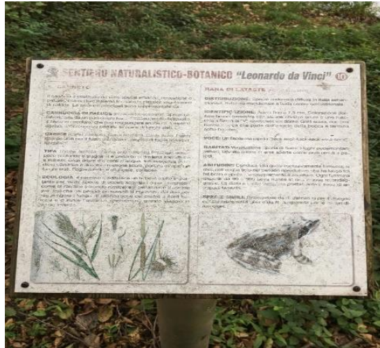
We encounter information panels about the flora and fauna present.