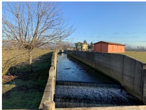
The water from the canal drains, flowing to west.