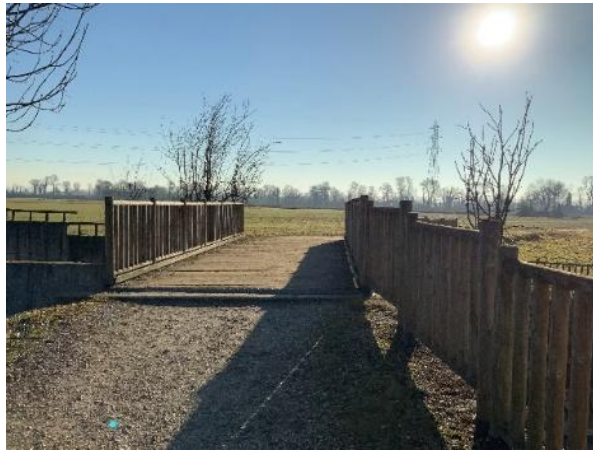
We climb over the small bridge and observe the area.