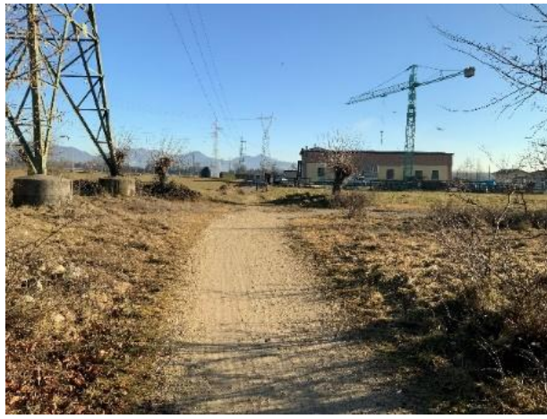
At the pylon we turn right.