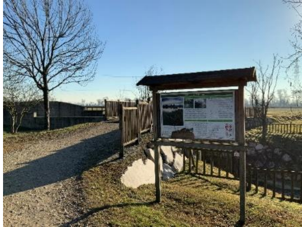
We now reach a spillway and decide to stop here, without continuing on to Malpaga and Ghisalba Castle.