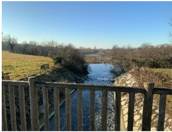
The spillway that drains into the Serio river.