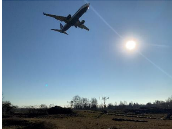
Arriving in the vicinity of the 'Frog Pond', we observe an aircraft in the process of landing.