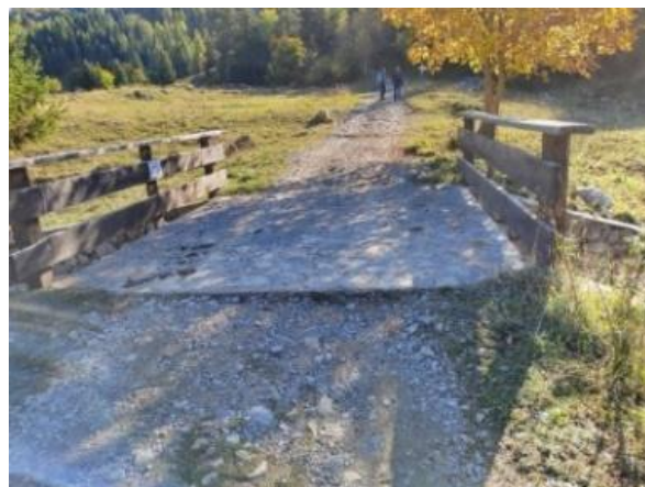
We cross the small bridge and continue to the right.