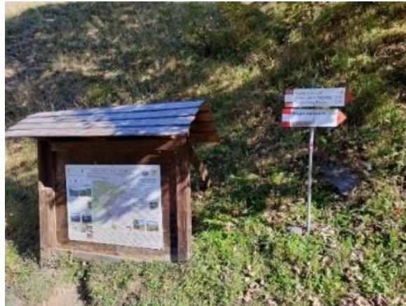
We come across a signpost informing us of the direction to follow, following the CAI path 428.