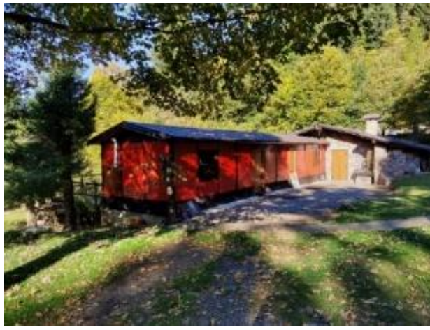
The red hut where we park.