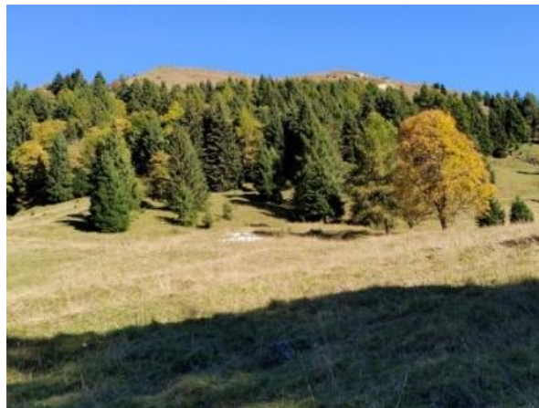
We admire the landscape around us.