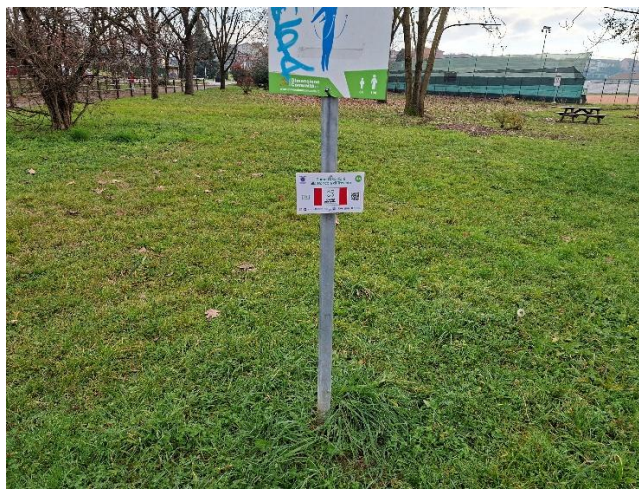
In front of us is the signpost indicating the circular route through G. Callioni Park.