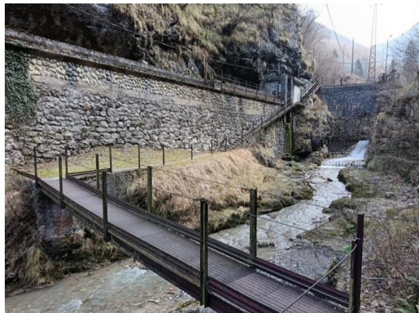
We turn left onto a small metal footbridge and follow the path down narrow steps.