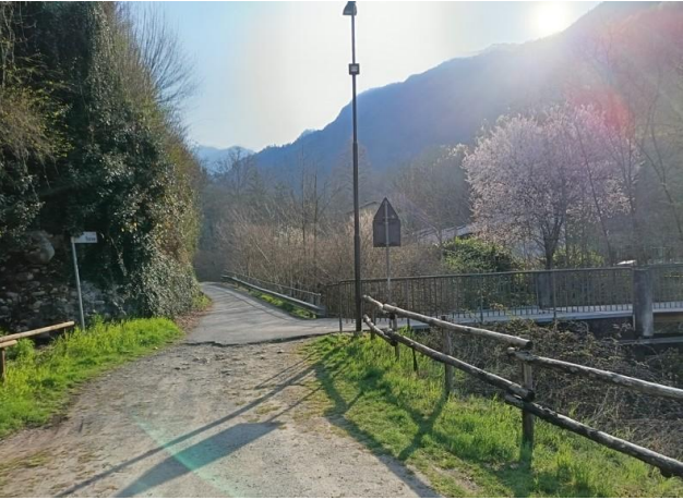
We reach and cross the tarmac bridge, to our right of Via Molini.