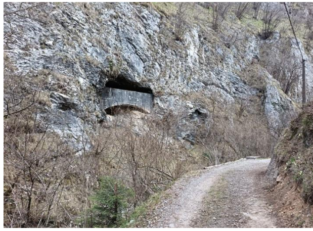
At a bend in the path, on the left side of the valley, a concrete structure appears in a cave.