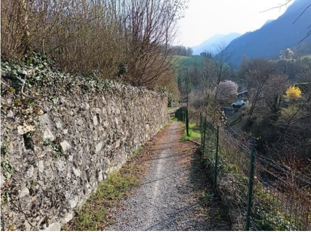
The surface is a mixture of small pebbles and earth, which does not hinder our progress.