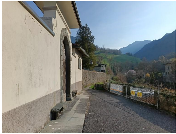
The road now narrows into a small path between the Oгна stream and the walls of the Istituto Beato Palazzolo.