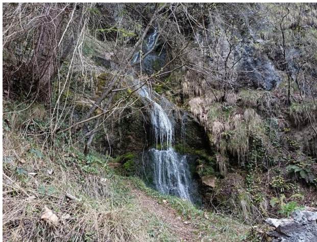
To our left, we spot a small waterfall, whose rhythmic flow brightens our walk.