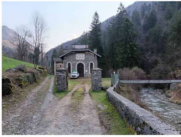
A small ENEL hydroelectric power station comes into view ahead of us.