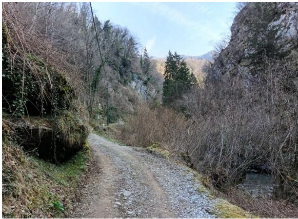
The path now begins to climb and the surface becomes less well-maintained.