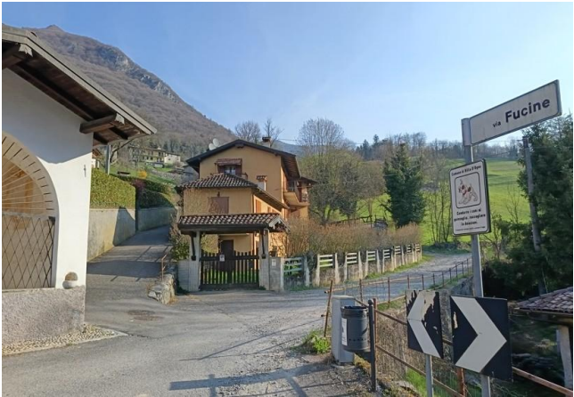
At the first junction, we turn right and continue along Via Fucine.