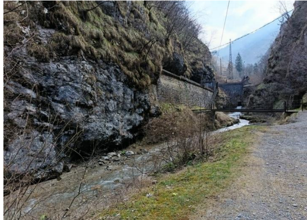
We have reached the end of the agricultural and pastoral road; here the valley is very narrow.