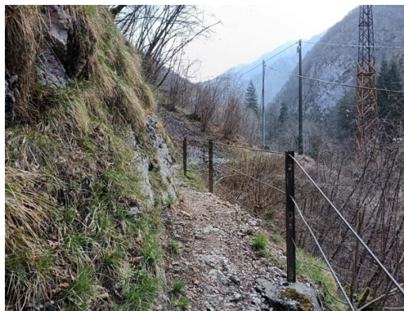
The path is now narrow, and the walk is made easier by safety barriers facing the valley, consisting of posts and metal cables.