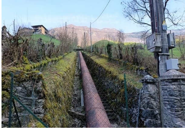
Along the way, to our left, we can see a penstock that supplies water to the power station.