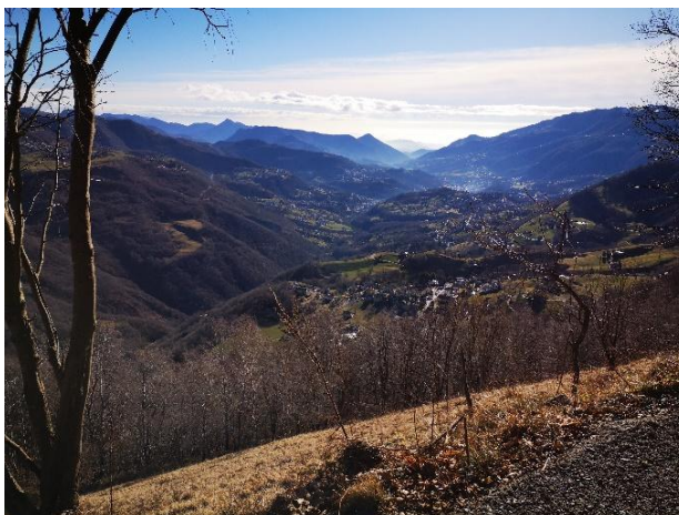
In the distance, we can admire the view of Brumano and the Imagna Valley.