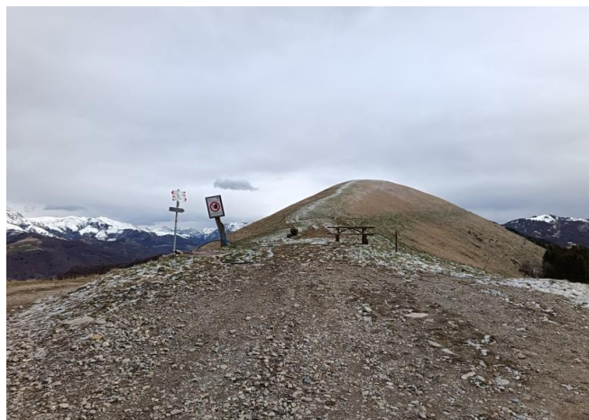
To our right, we can admire the Costa del Palio.