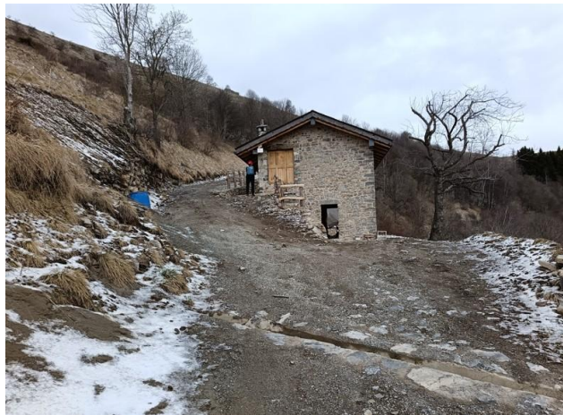
Along the way, we come across some mountain huts undergoing renovation.