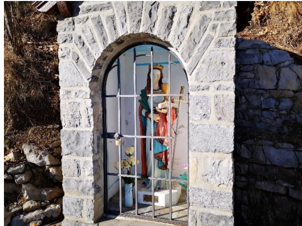
We pass a small stone shrine on our right.