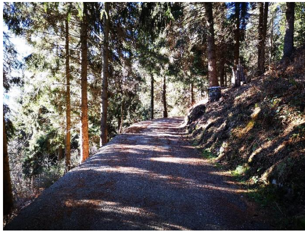
The surface is firm and the walk is pleasant.