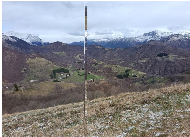
The valley is full of meadows and mountain pastures.