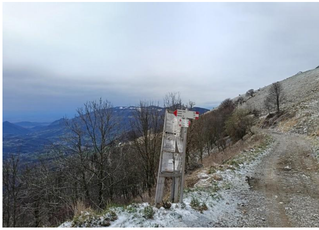
A sign points us towards the valley in the Lecco area.