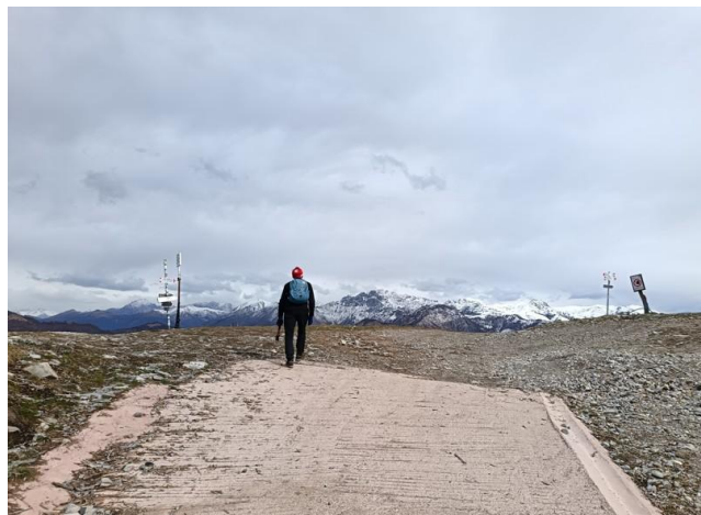
We have finally reached Passo del Palio.