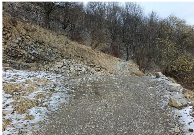
The road now levels out slightly and continues up the mountain on the right.