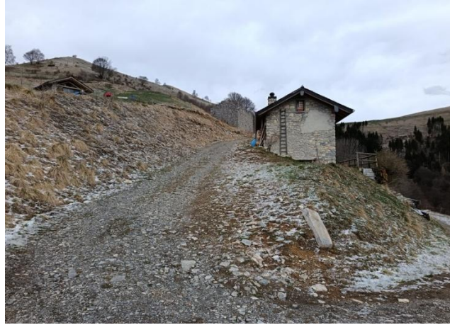
After this hairpin bend, we reach a house on the right.