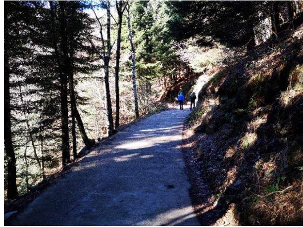
The ground remains firm as we climb a gentle slope.