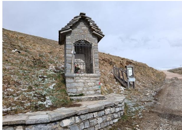
We reach and pass a small stone chapel.