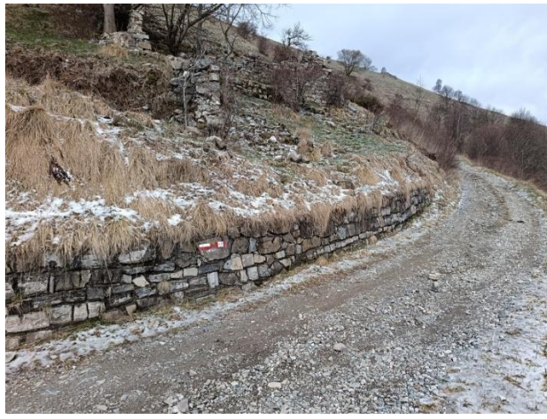
A series of bends and counter-bends will take us towards Passo del Palio.