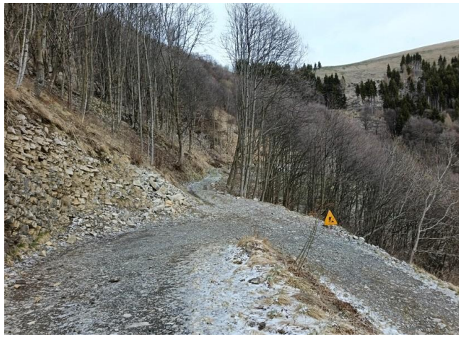
The road climbs at a steady gradient thanks to the hairpin bends.