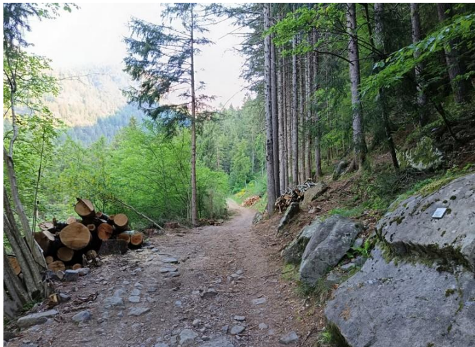
On a rough stretch of the path, there are small cut logs on the left.