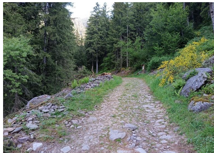
The ground is uneven with stones protruding from the soil; care must be taken in wet weather.