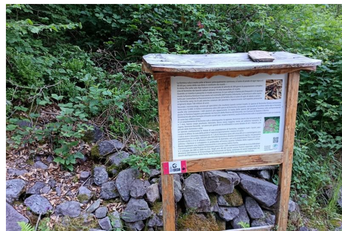
On the right, we find a sign informing us of the presence of the "Formica Ruffa" ant.