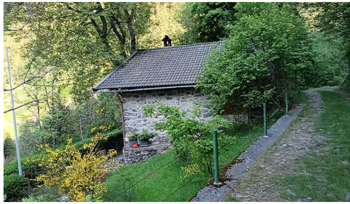
After re-entering the woods, we come across the "Baita del Nono" on the left.